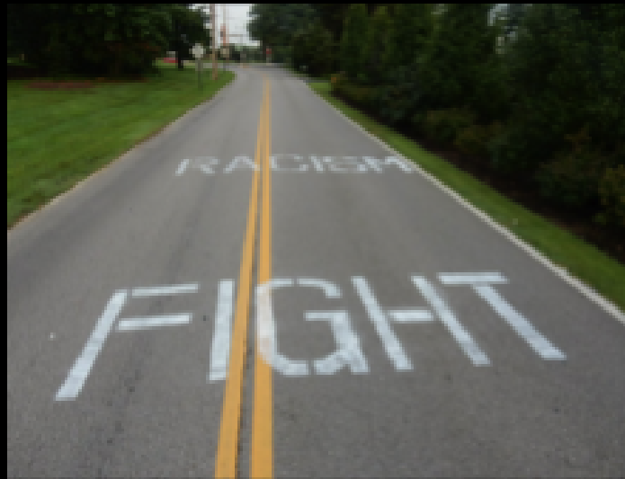
Fight Back 365 Artivists STL