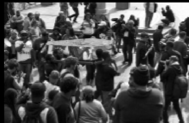
Mirror Casket, Artivists STL